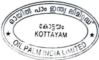
SENIOR MANAGER (H.R.D)