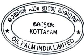
SENIOR MANAGER (H.R.D)