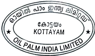
SENIOR MANAGER (H.R.D)