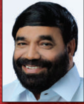
Sri. V.N Vasavan

(Hon. Minister for Higher Education & Social Justice)