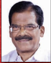
Sri. Thomas Chazhikkadan

(Hon. Minister for Co-operation & Registration)