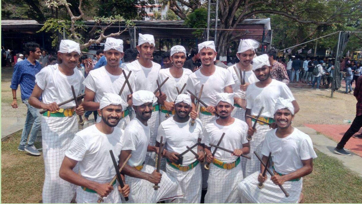
Students performed Kolkali for University Youth festival during the Academic year 2017-18