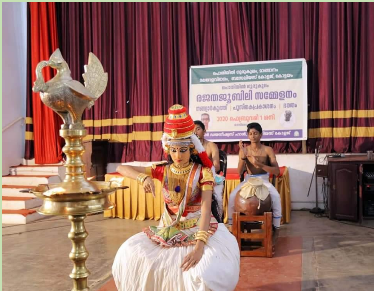
Nangyarkoothu performance at Baselius college in association with Pothiyil Gurukulam

The college emphasizes the need for encouraging languages outside native language and English. The departments of Hindi, Sanskrit and Syriac are very active in not just academic activities but other areas as well. Syriac department hosts a DTP course to acquaint and train an international language to the aspirants. Hindi department organizes Hindi fests that include various competitions at inter-collegiate and inter-departmental levels. Syriac department in collaboration with Malayalam department organizes workshops on Kathakali, Koodiyattam ,nangyar koothu and chakiyaarkooth every year to inspire and familiarize the traditional art forms to the present generation in association with Pothiyil Gurukulam.