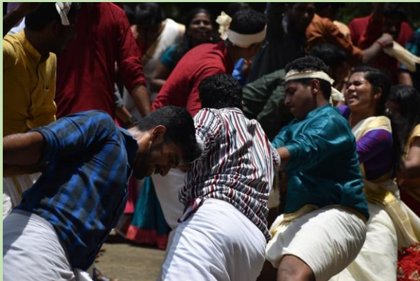
Pic- Tug of war competition during onam celebration