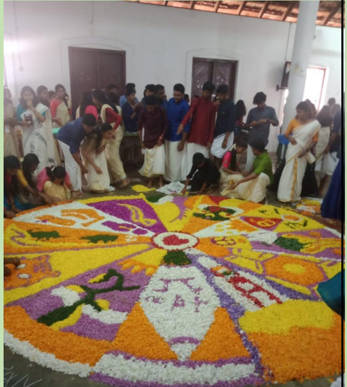
Mega pookalam by the students in association with Onam Celebration

Along with the college level celebrations, every departments celebrates the festival with all its students by making the Pookkalam for the competitions together, enjoying the Onam Sadya together etc. Apart from all the fun that students enjoy, various departments visit old age homes and care homes and distribute Payasam, an onam delicacy to the members and join them in the celebration. These experiences are momentous for the students as they inculcate social values and commitment and understand the need for including their fellow beings in moments of happiness as well.