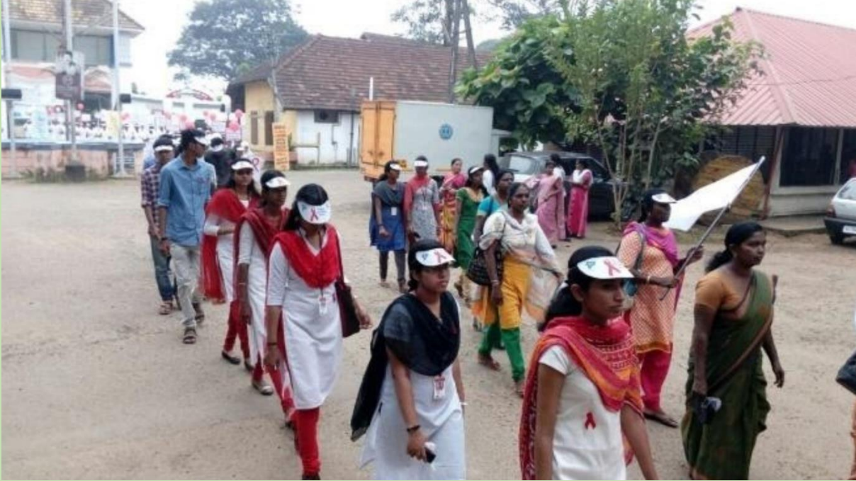
Rally in connection with World AIDS day

World Aids Day observance have taken the different forms of poster exhibition, brochure distribution, seminar, flash mob street plays and rally, all of which promulgated the message of creating an inclusive environment for the patients.