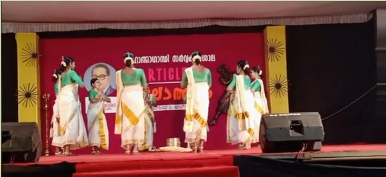
Students performing thiruvathira at University Youth festival

The tradition of celebrating Arts Fest has etched a significant place in the colleges of India. College Arts festival is not just about fun but is also widening the horizons of student's learning experience. College Arts festival is one of the biggest cultural events organized in our college. Arts day is conducted in three days and is organized under the aegis of the Arts club. Students are divided into four groups and mostly titles for the groups are selected from the repertoire of names of artistic relevance, for instance names of musical instruments, genres etc. the group that fetches maximum points bags Along with the competitive spirit, the programs conducted try to make a cultural impact on students.