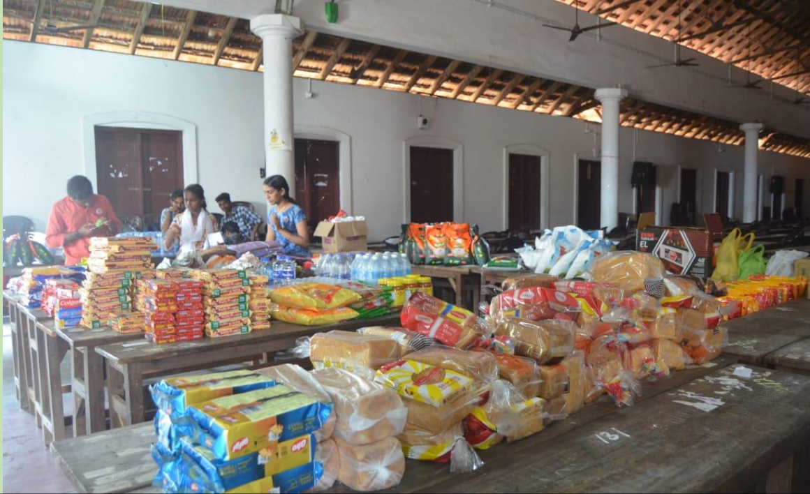
Kaithaangu- flood relief activities