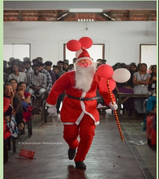
Pic- Christmas celebration at college

Christmas is the season of joy, peace, and happiness and reminds us the necessity of sharing the happiness and spending time with the poor and the needy. Students of Baselius follows the practice of caring for the needy and poor during Christmas season. Students from departments and volunteers from various clubs and groups like NSS/NCC visit and celebrate Christmas with nearby Care Homes, distribute cakes and sweets and make the day memorable for the destitute as well. At the college level, Carol competitions, Christmas tree competitions, Christmas Father competitions etc are held. Cake cutting, gift exchange etc are also conducted at the department level spreading the message of goodness and joy.