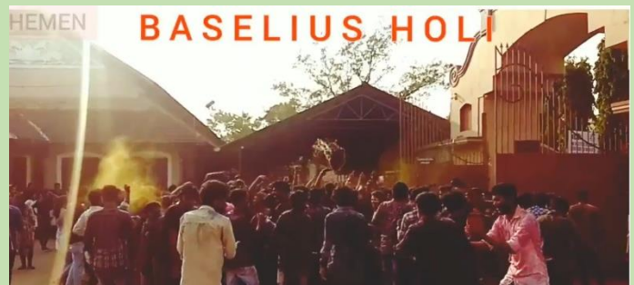
Pic -Students celebrating Holi in the campus

Holi known as the festival of colour and love is now commonly celebrated in Kerala college campuses. The students of Baselius share the fun of dancing through the streets and throw coloured dye on each other thereby forgetting all resentments and bring joy to one another.