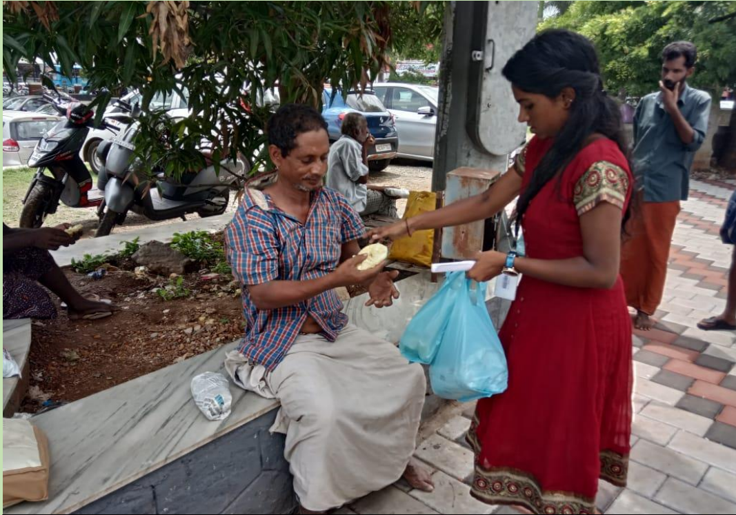
Pothichoru- free meal packet distribution

Abuse day awareness are some initiatives that serve as testimonies for the inculcation of various efforts taken by the college in providing tolerance and harmony towards various communal, socio economic diversities.