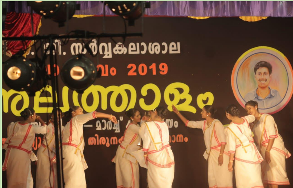
Students performing Margamkali at University youth festival

their artistic abilities to their fullest. Students selected from the college level enters the University arts festival. Financial support and practice sessions are provided by the College to students until the day of competitions. The hardwork and effort reflect in the handful of prizes that the student bags in MG University Kalolsavam every year.