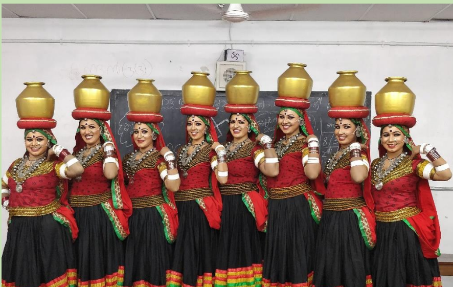
Rajastani folk dance "Ghoomer" was performed by the students during the University youth festival 2017-18