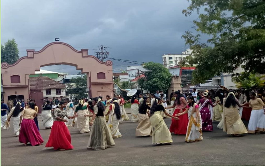
Pic- Students performing mega thiruvathira during onam celebration