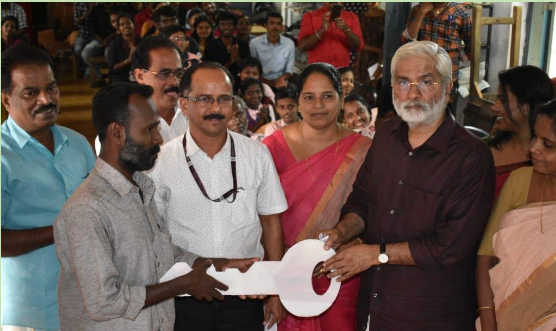
Snehaveedu- Hand overing the keys of renovatd house to the owners

Similar engagements of the college volunteers include Pothichoru and Snehapatheyam (free meal packet distribution to the destitute in the nearby locality every Friday and Thursday).. Kaithaangu- flood relief activities, participation of students in awareness programs like Elders