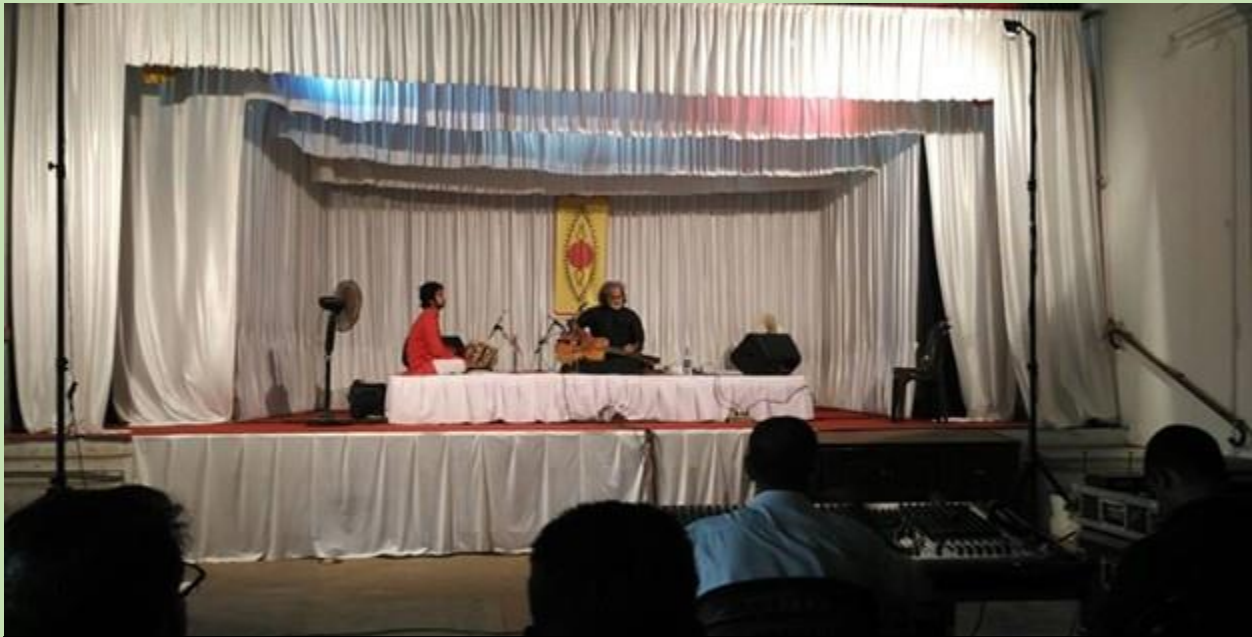
Maestro Padmabhushan Vishwa Mohan Bhatt performing Mohan veena at Baselius College