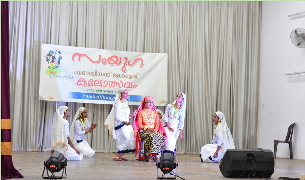
Students performing Oppana for College Arts Festival