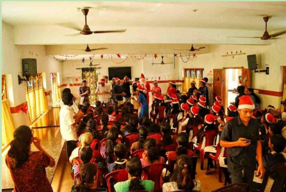
Students extending their Christmas celebration beyond campus.