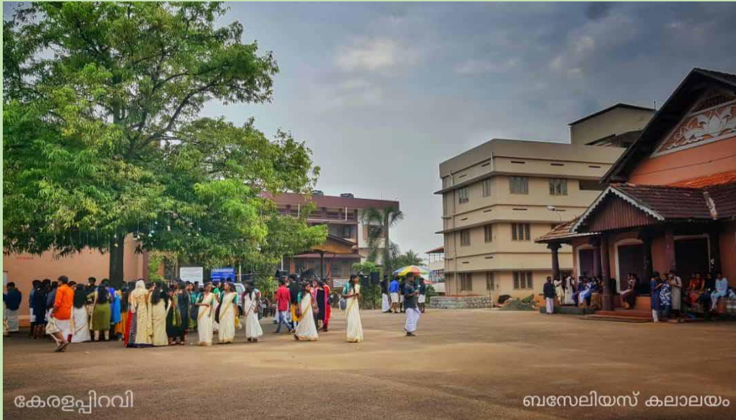
Students in traditional Kerala attire on Kerala Piravi day

Kerala Piravi marks the birth of the state of Kerala on November 1st, 1956. It is day of celebration for Baselius as students and staff wear traditional Kerala attires and the whole campus reflects the legacy of the tradition. Competitions like Kerala Shalini, Kerala Shreeman etc are held where students exhibit their knowledge and views about our state and its history. Group song competitions and choirs singing songs about the Kerala history and tradition are major events of the day. Departments occasionally hold exhibitions showcasing our history and stories from the past. Students share and spread the joy to the townsfolk as well as they mingle with the common public through the chendamalam and procession accompanying the celebrations.