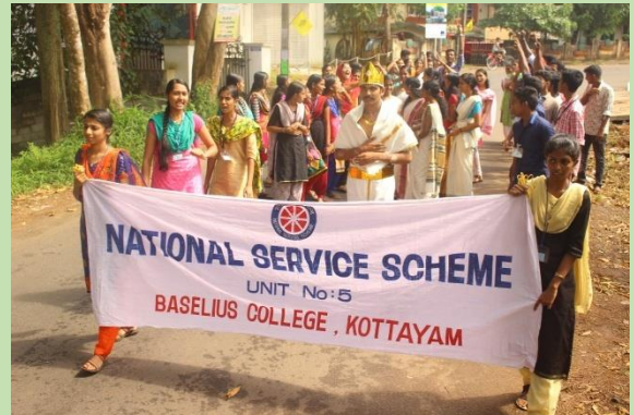
Volunteers conducting Onam procession in the Adopted village