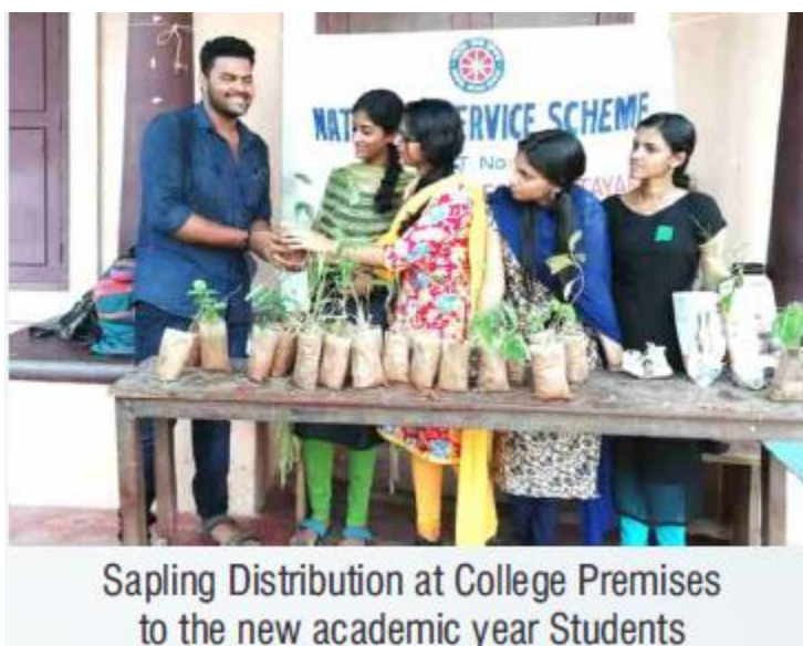
Sapling Distribution at College Premises to the new academic year Students

The unit welcomed the students of the new academic year and their parents with the message of greenery by setting up the Green Stall of saplings and cloth bags in the college. 418 saplings and 35 cloth bags were sold. The insight of plastic free, clean and green Kerala, reached everyone.