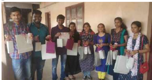
(r)WEALTH OUT OF WASTE:PAPER PEN AND PAPER BAG MAKING- 31 st JULY 2019