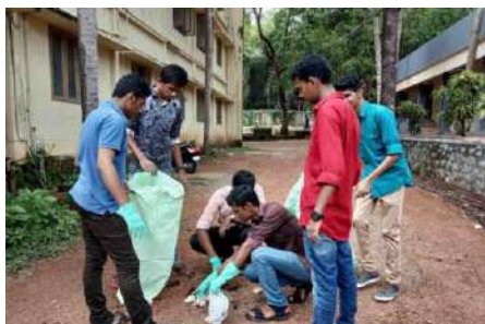
(s)PRE-MONSOONCLEANING- 18 th MAY 2019