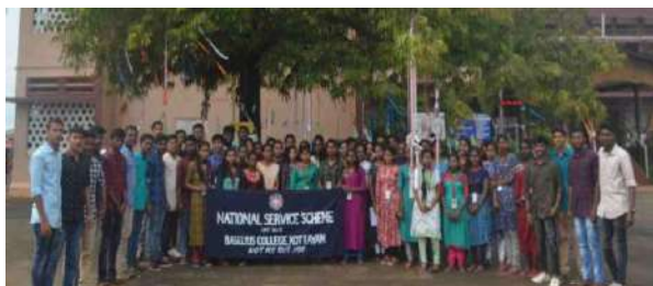
(p)SWACHATHA HI SEVA- 17 th SEPTEMBER 2019