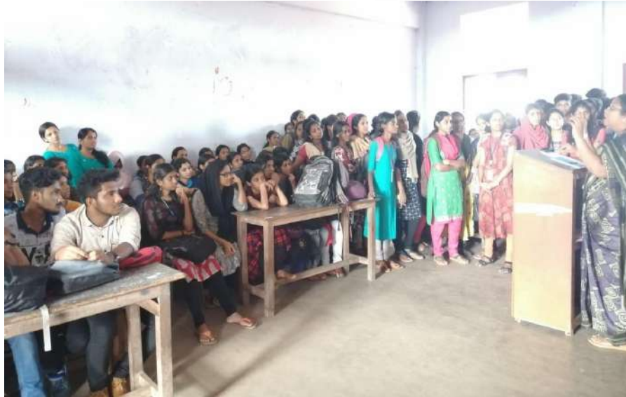
1 st Club Meeting