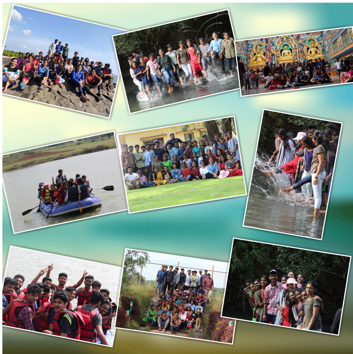
Study Tour 2019 -Moments