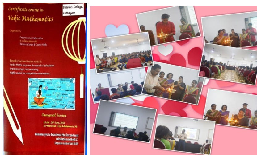
Vedic Mathematics programme moments