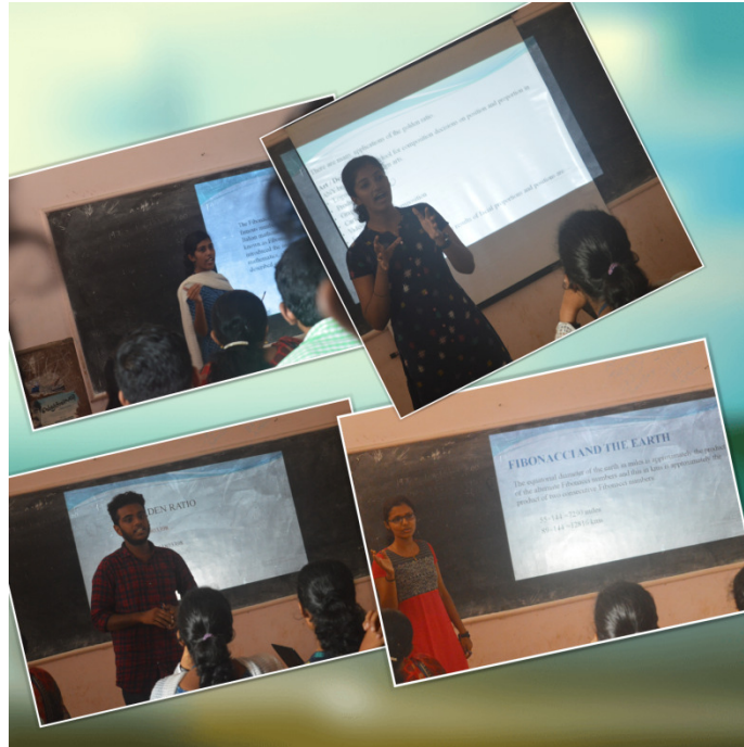
Moments of Mathematics Colloquium