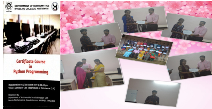
Python programme moments

gateway towards Data Science career. 34 students registered and successfully completed the course.