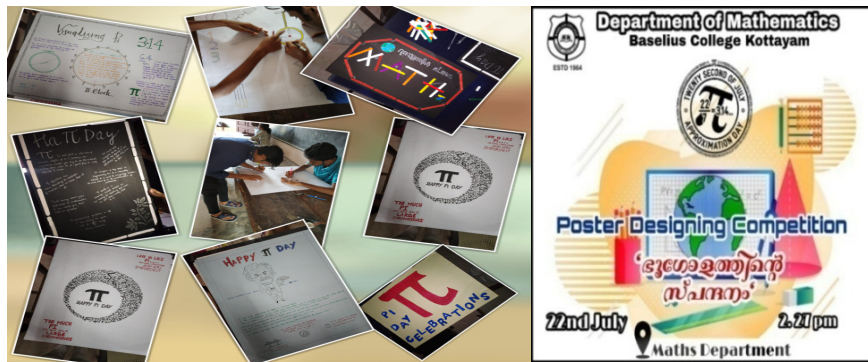
Poster Designing Competition