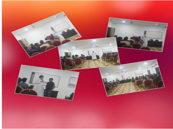
Orientation programme for D2 and D3

students enjoyed every minute. The programme came to an end at 4.30 pm.