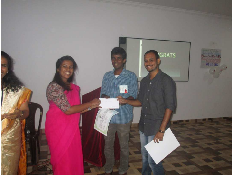
PowerPoint presentation competition prize distribution