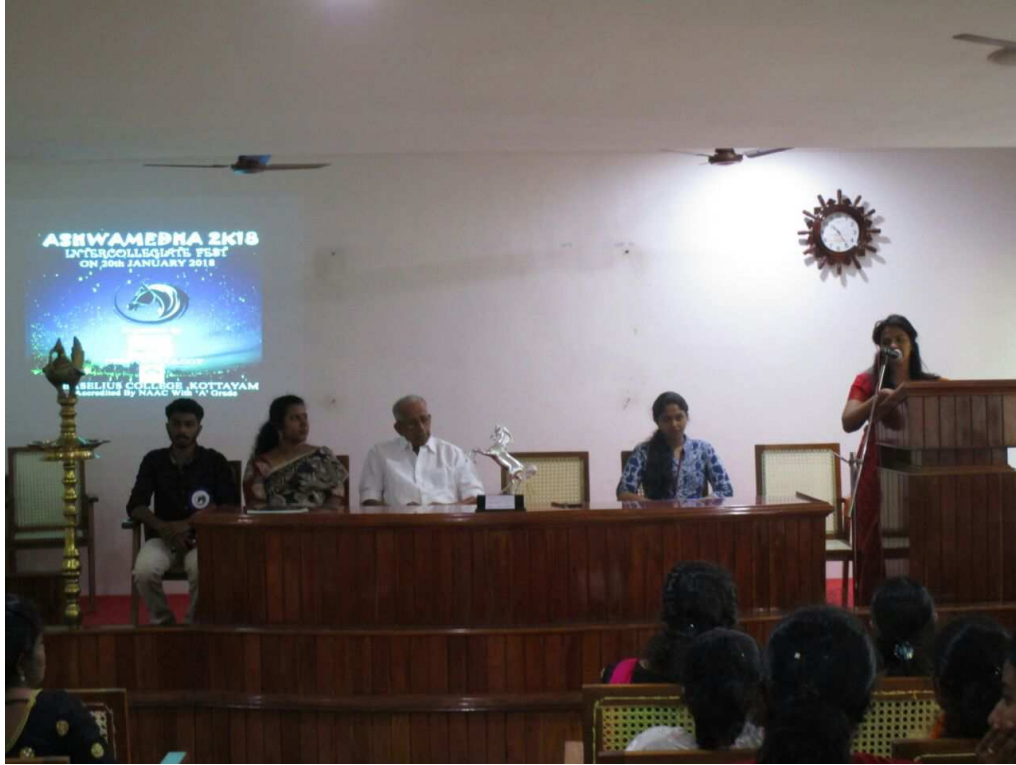
Ashwamedha inauguration ceremony