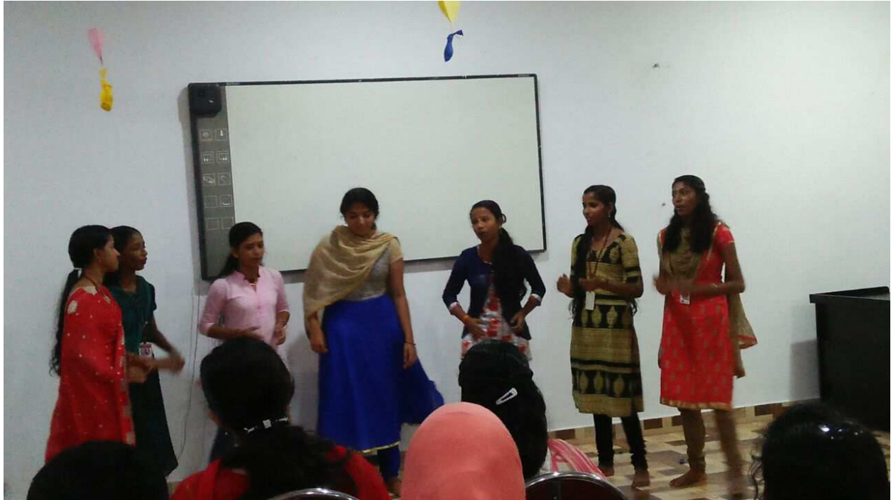
Fresher's day celebration