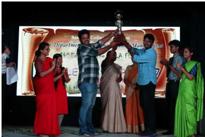
Overall Champions: K.G College, Pampady.