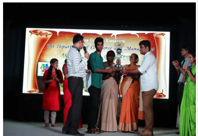
Runners Up: St. Thomas College, Pala.