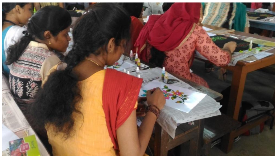
Students engaged in glass painting during the Pidilite painting class