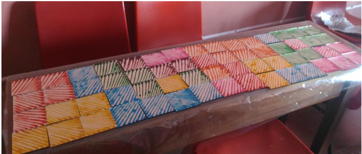
Kaleidoscope stage setting preps