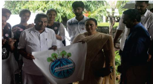
Sri Thiruvanchoor Radhakrishnan(MLA) Launching Bhodi 2020

The National Service Scheme of Baselius College observed World environment day on June 5, 2017. Honourable M.L.A Thiruvanchoor Radhakrishnan inaugurated the programme “Bhodi Naleykayoru Thanal” by planting 1 Lakh trees within 3 years in the district of Kottayam.