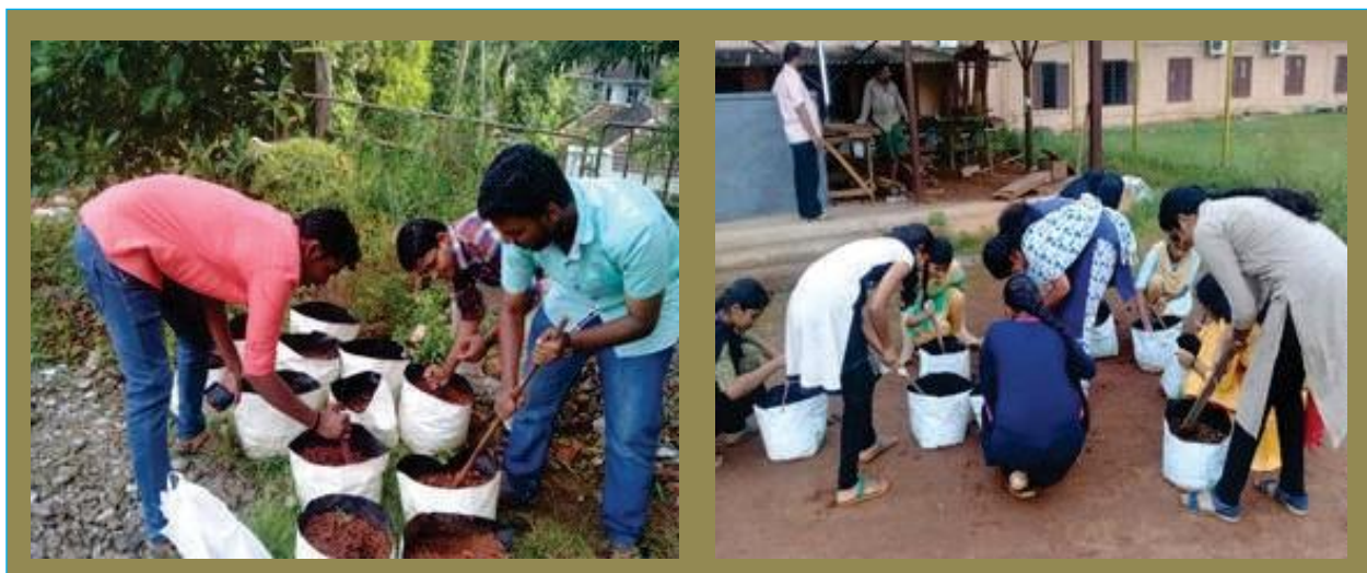
Farming in the Baselius College campus by NSS volunteers