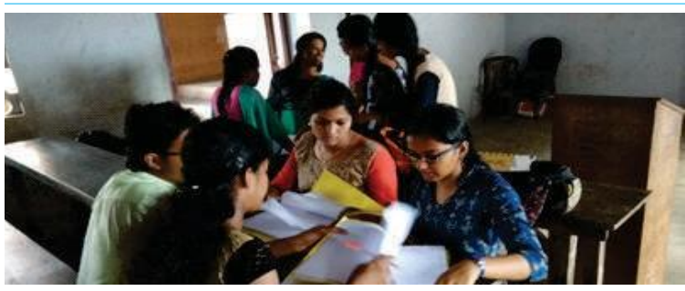
NSS Volunteers creating the handwritten magazine

Volunteers of our NSS Unit prepared a beautiful handwritten magazine for the competition initiated as part of the programme “Vimukthi”. Our Unit has won 1 st prize in the competition at the district level.