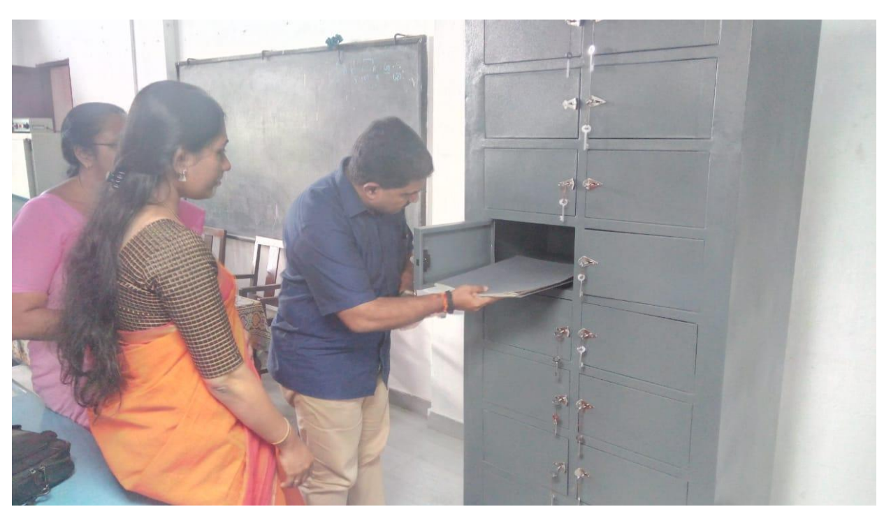
Handing over of Herbarium cabinet by 1990-93 BSc. Botany batch