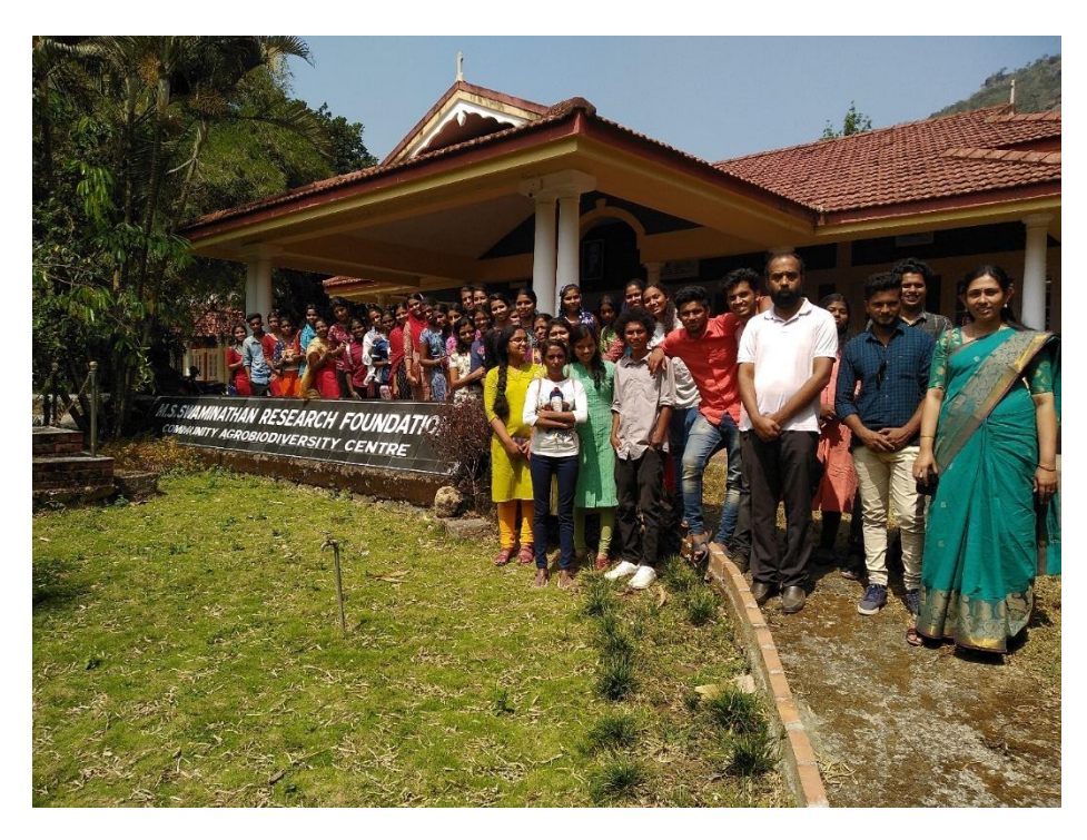
Final year students (2016-19) in front of MS Swaminathan Research Foundation, Wayanadu