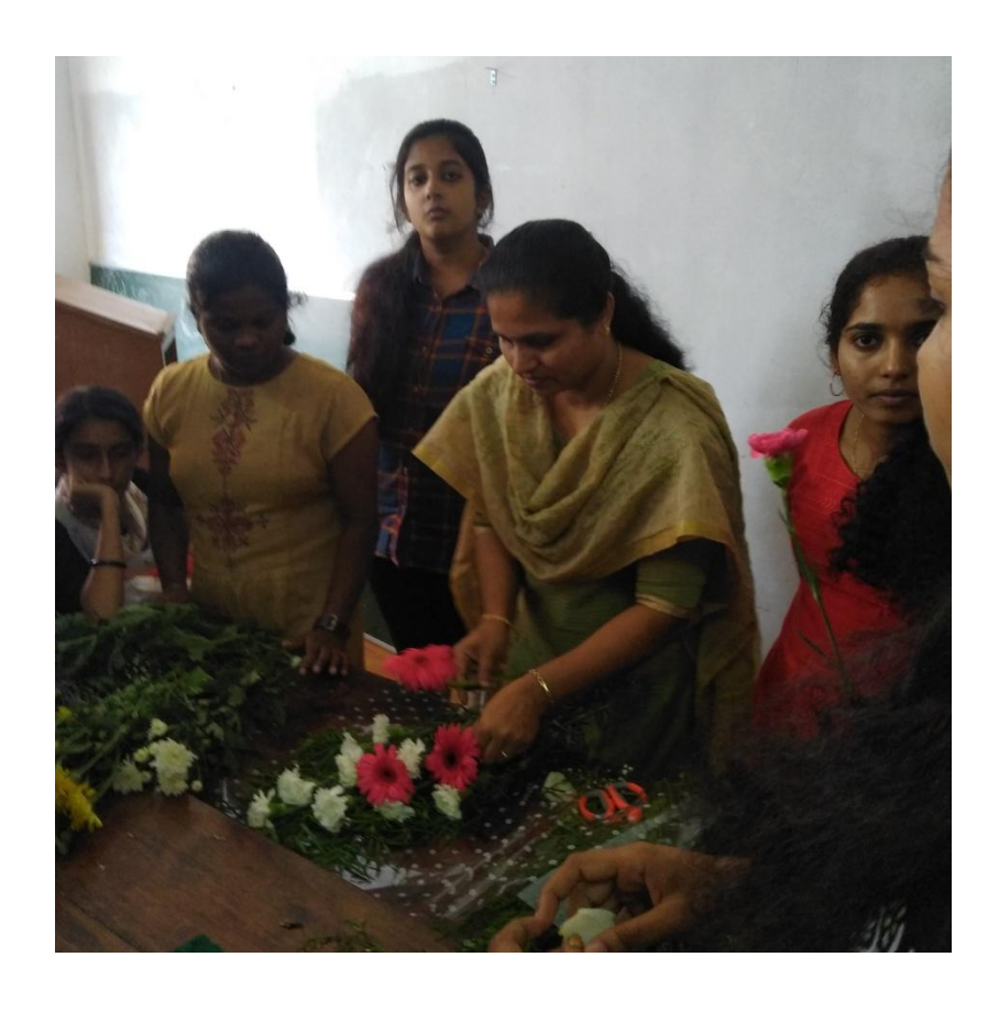
Demonstration by the resource person