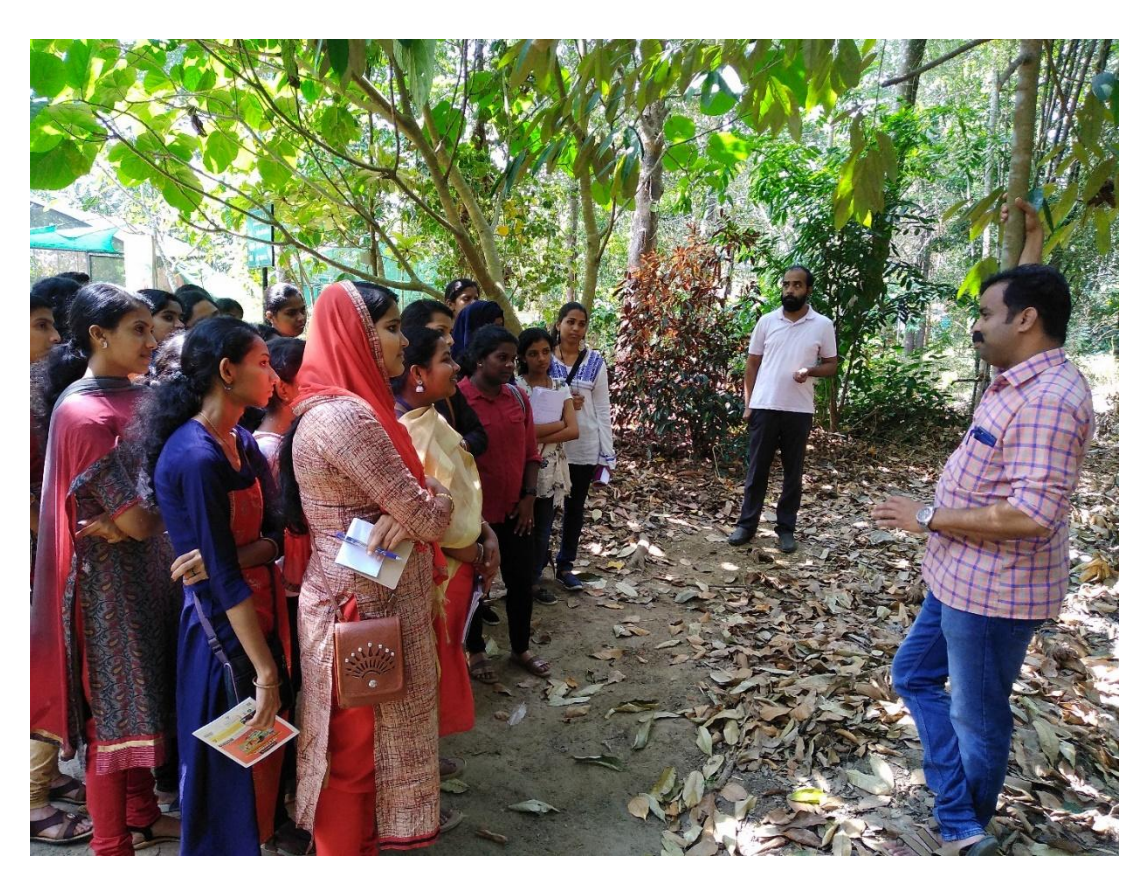
Visiting Plant Conservatory at MSSRF, Puthoorvayal, Wayanadu

A field visit was conducted on 31.1.2019 to 4.02.2019 with our D3 students to MSSRF, Puthoorvayal, Wayanad, Mysore and Belur as part of curriculum. Students collected plants from the rural vegetation and preserved it for haerbarium preparation. They also got an opportunity to see many plants in the field that were known to them earlier only through names. They received a class from the scientific staff of MS Swaminathan Research Federation, Puthoorvayal, Wayanadu regarding the various activities of the institution, why and how it established etc. Later students visited the premises of MSSRF with special emphasis to conservatory and tissue culture Laboratory. Dr. M. V. Krishnaraj, Prof. Arabhi P. and Mr. A M Varghese were accompanied the study tour.