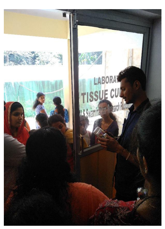
Visit to Tissue Culture lab at MSSRF, Puthoorvayal, Wayanadu