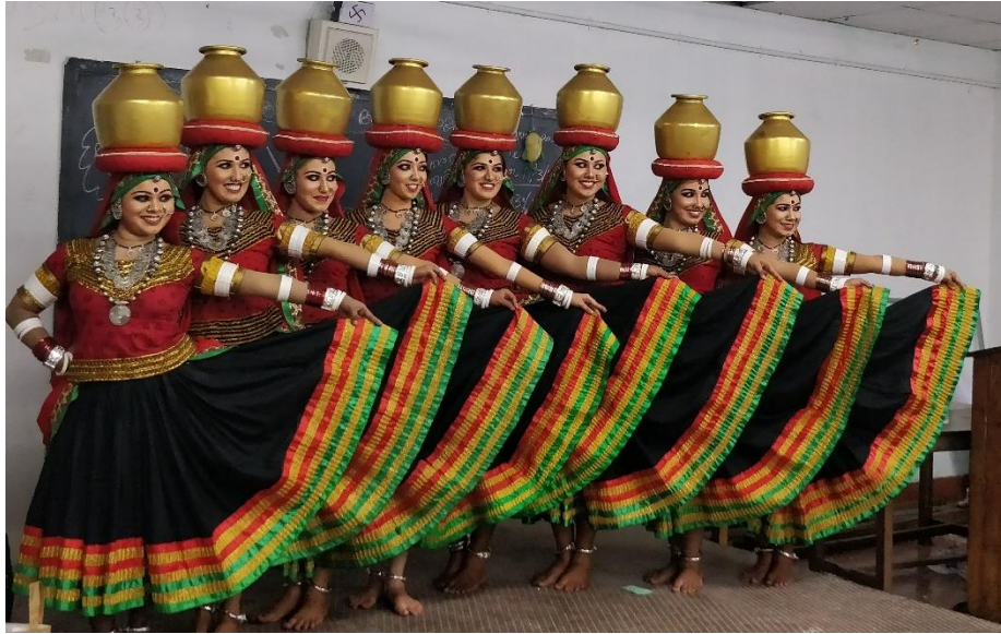
GROUP DANCE TEAM-2017-18