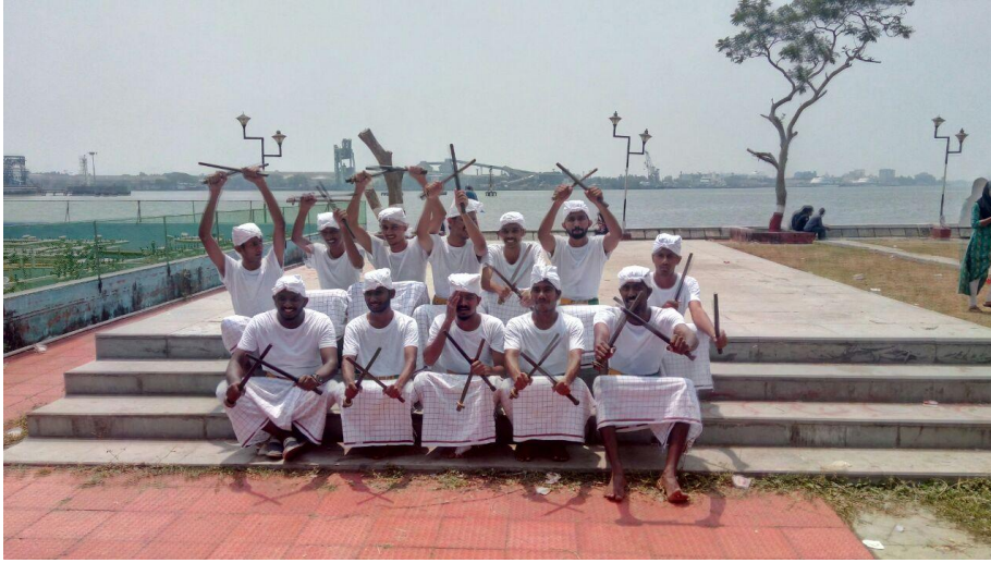
MARGAMKALI TEAM-ASHAANTHAM 2018