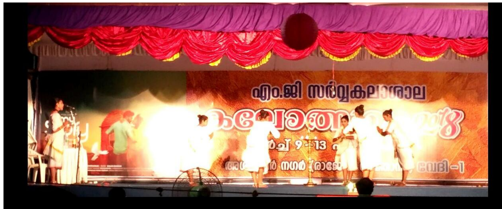
KOL KALI TEAM PERFORMANCE IN ASHAANTHAM 2018